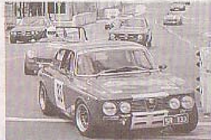
Italy versus Britain.